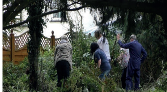
Scouts working hard to clear beds