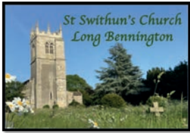
St Swithun's Church Long Bennington

Many thanks to all of you - both individuals and local organisations (including the Parish Council, Co-op and Rotary Club) - who support our village church through your giving and donations. Thank-you also to those who sponsor or support our sociable fund-raising events – which we aim to make enjoyable for all attending. Many may not realise but these are the main ways we fund church mission, building repairs and all our running costs, including churchyard maintenance. The only other money received comes from special service fees (weddings and funerals).