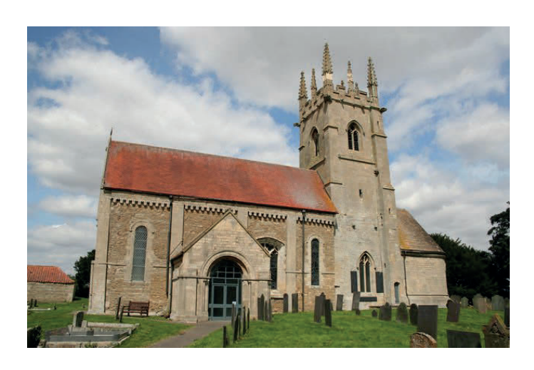
St Andrews Church Sempringham

Today the hamlet of Sempringham has a parish church, dedicated to St Andrew, and a holy well. The hamlet is now part of the civil parish of Pointon and Sempringham.