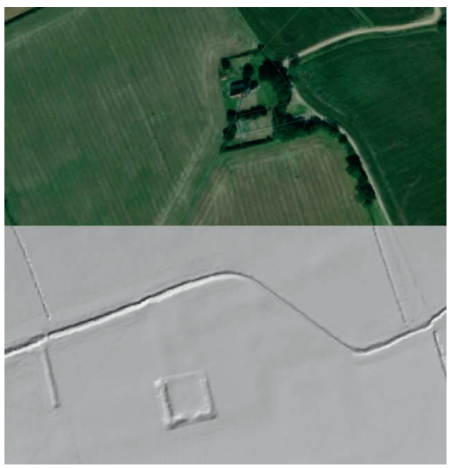
Lidar image of the Priory, showing the monastery and the church

Sempringham Priory was built by Gilbert of Sempringham, the only English saint to have founded a monastic order, in 1131.