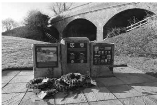
War Memorial at Sudbrooke moor Gold Club. Old railway line bridge in background.